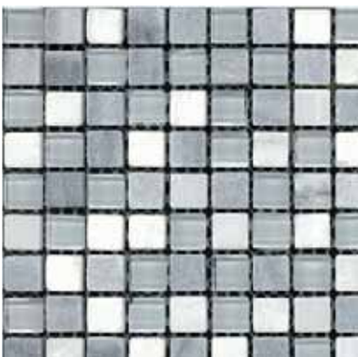
GLA CNSH 58