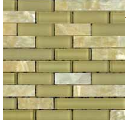
GLA CNDU LIN