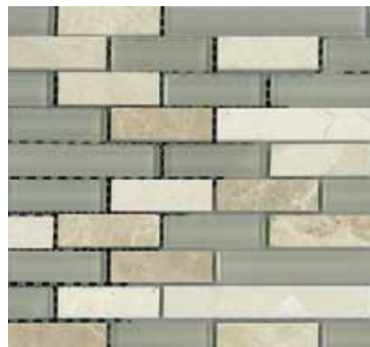
Lineality | mixed sizes |