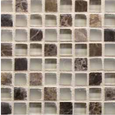
GLA CNNO 58