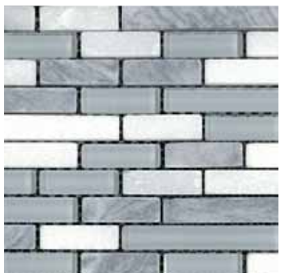
GLA CNSH LIN