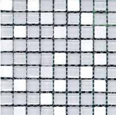
GLA CNPO 58