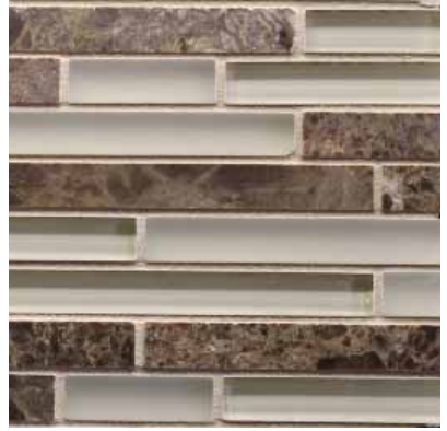
GLA CNNO LIN