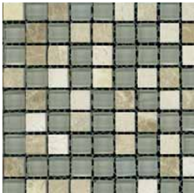
| 5/8 x 5/8 |