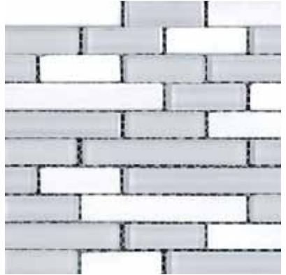
GLA CNPO LIN