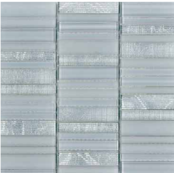
GLACGFOPIXI | pixi mosaic |