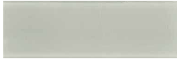
GLACGGG412 | 4 x 12 |