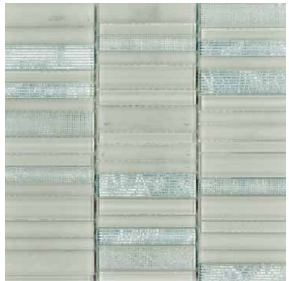
GLACGGGPIXI | pixi mosaic |