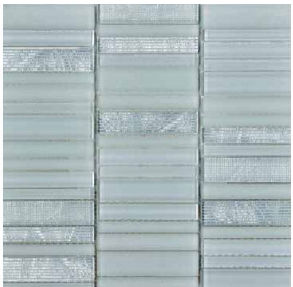
GLACGCLPIXI | pixi mosaic |