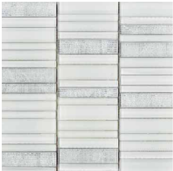
GLACGSWPIXI | pixi mosaic |