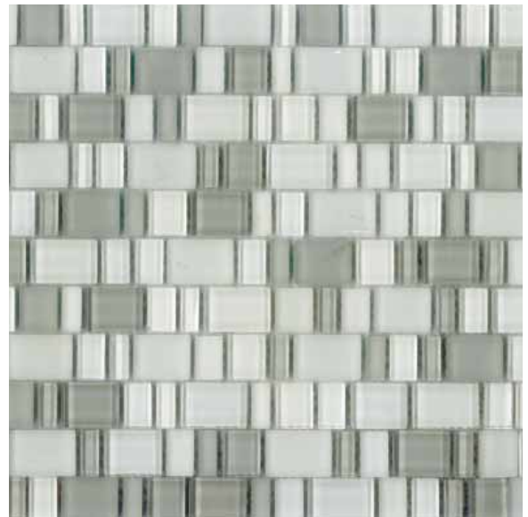
GLACGGGBOND | bond mosaic |