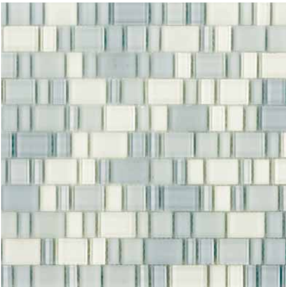
GLACGFOBOND | bond mosaic |