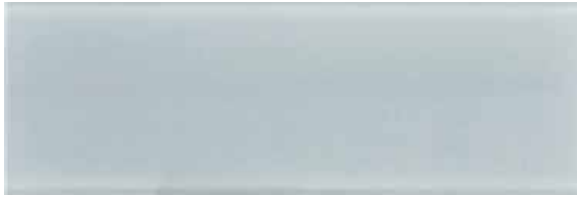
GLACGFO412 | 4 x 12 |