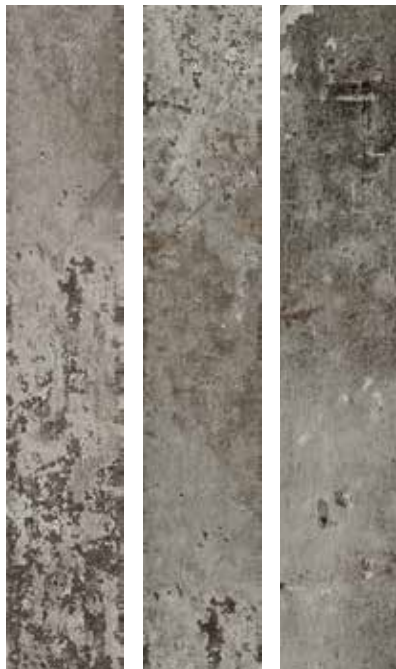
| 6 x 33 |