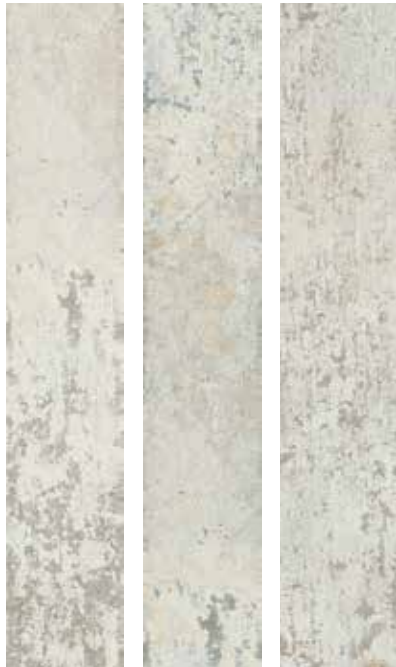
| 6 x 33 |