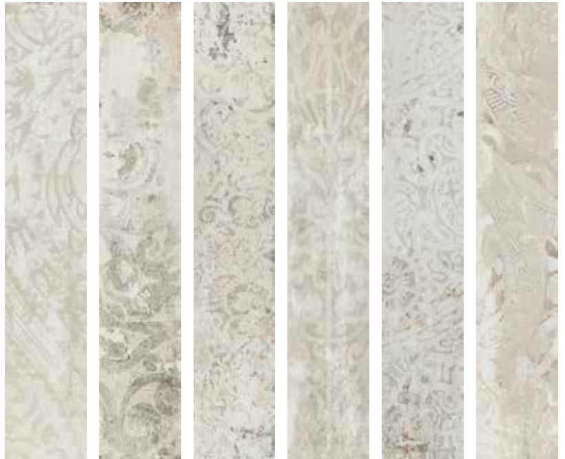
| 6 x 33 deco |