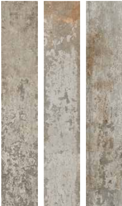
| 6 x 33 |