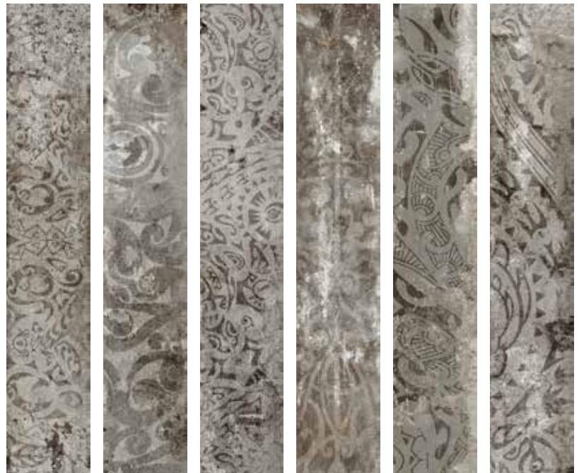
| 6 x 33 deco |