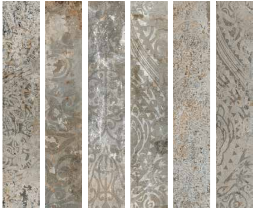
| 6 x 33 deco |