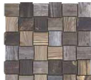
| Intermix Mosaic |