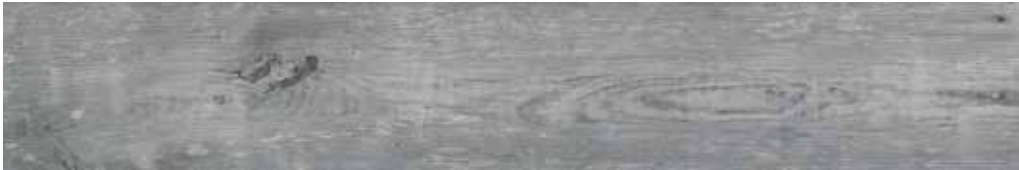
| 8x48 |