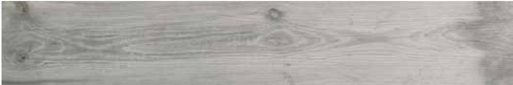
| 8x48 |