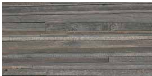
| 12x24 |