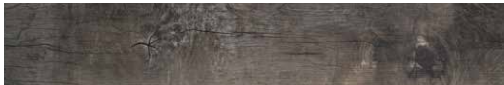
| 8x48 |