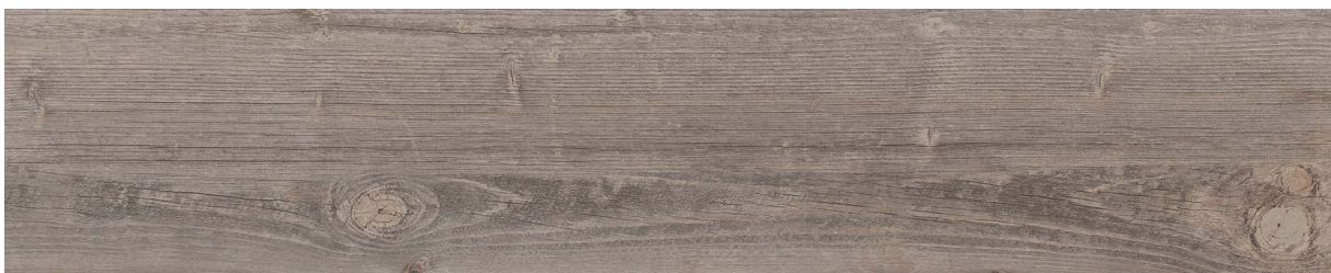
| 8 x 40 |