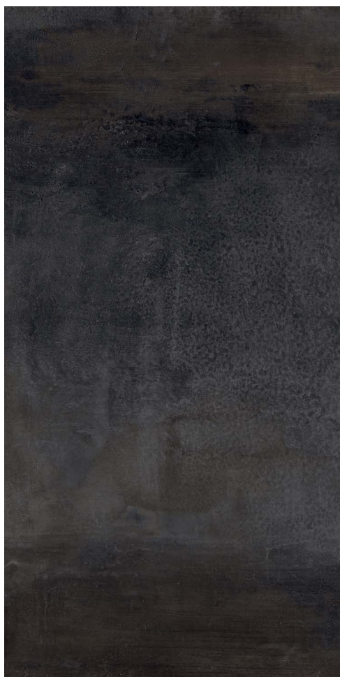
| 24x48 |