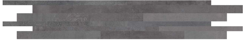
| 6.5x40 3D lineality |