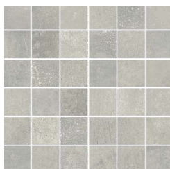
| 2x2 mosaic |