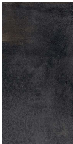
| 12x24 |