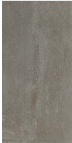
| 12x24 |