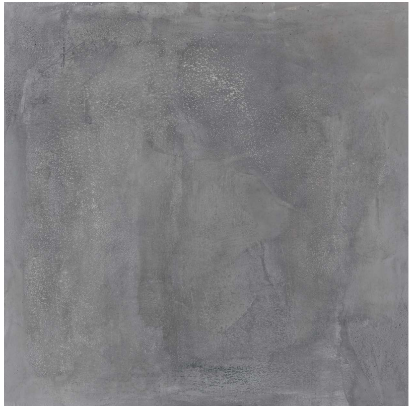
| 40x40 |