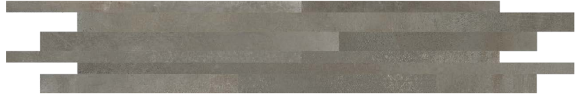
| 6.5x40 3D lineality |