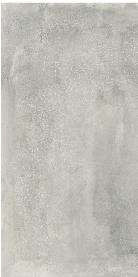
| 24x48 |