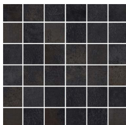
| 2x2 mosaic |