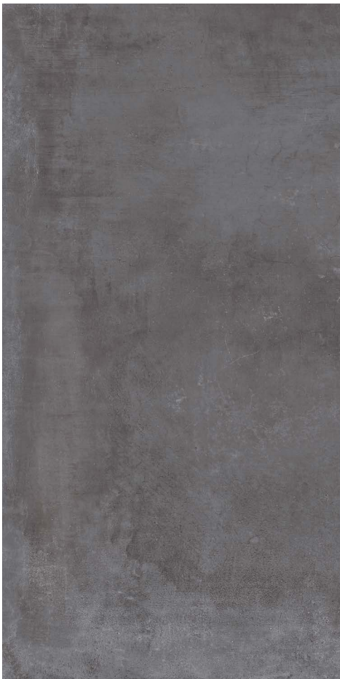
| 24x48 |