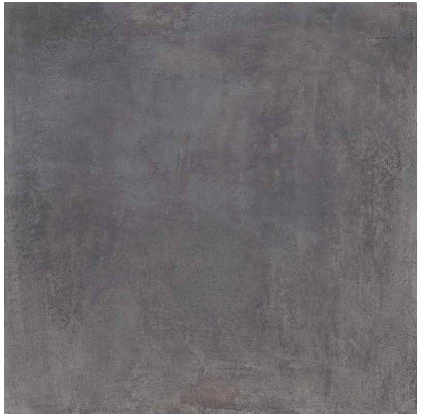
| 40x40 |