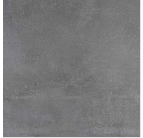
| 24x24 |