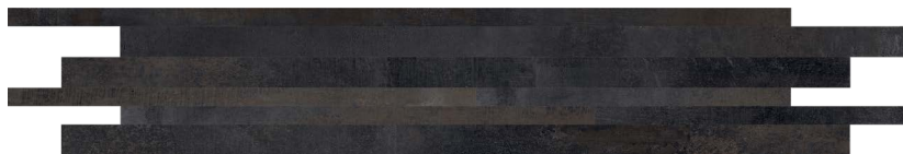
| 6.5x40 3D lineality |