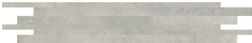
| 6.5x40 3D lineality |