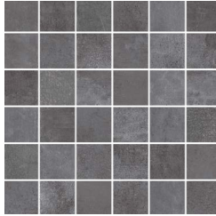
| 2x2 mosaic |