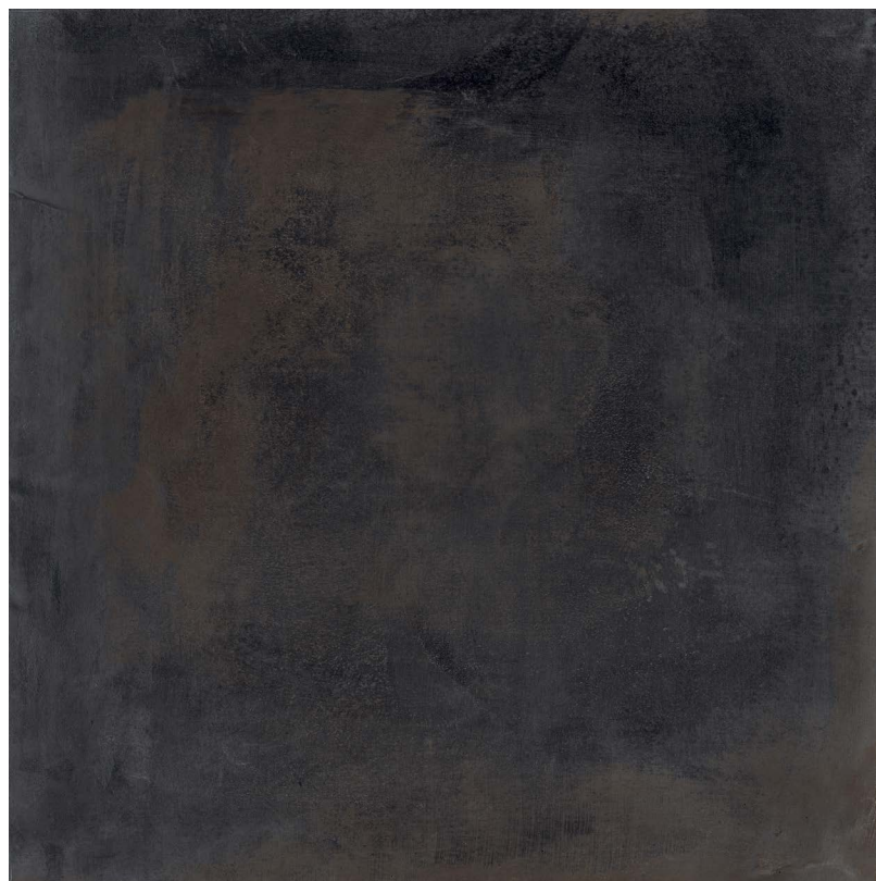
| 40x40 |