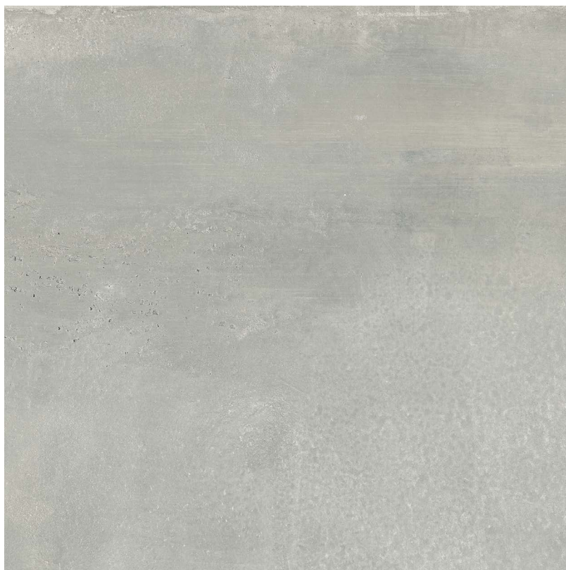
| 40x40 |