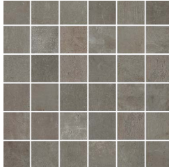
| 2x2 mosaic |