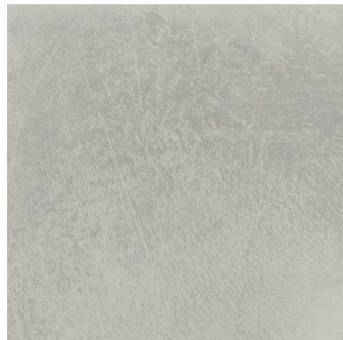
| 24x24 |