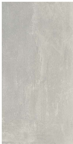
| 12x24 |