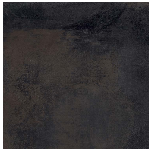
| 24x24 |