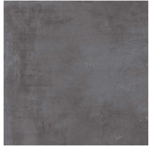
| 24x24 |