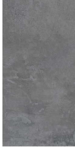
| 12x24 |