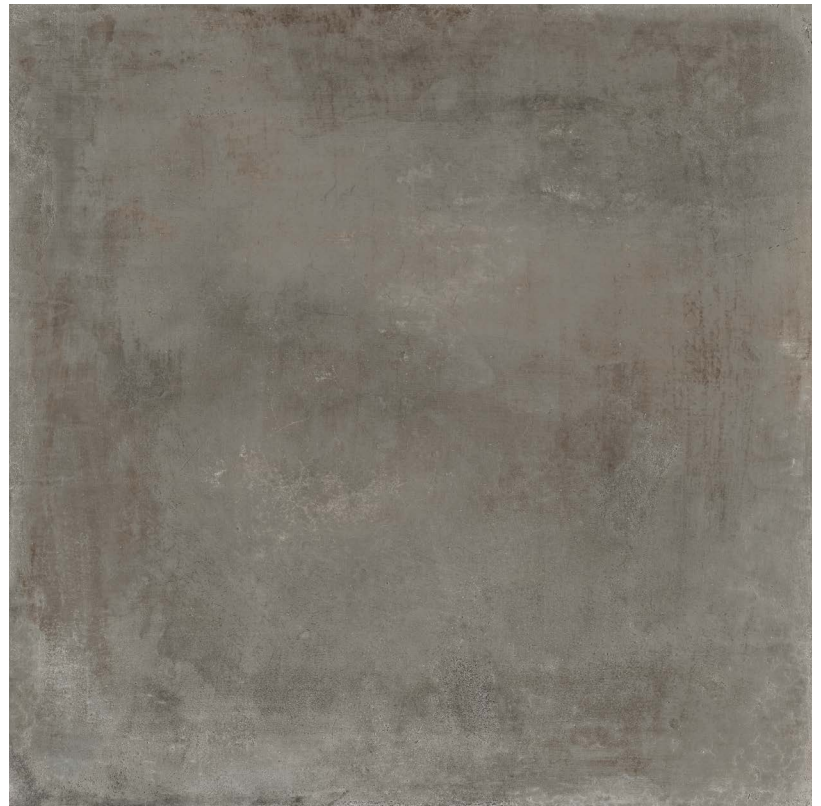
| 40x40 |