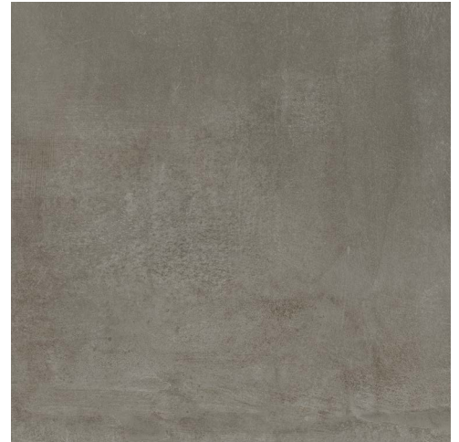
| 24x24 |