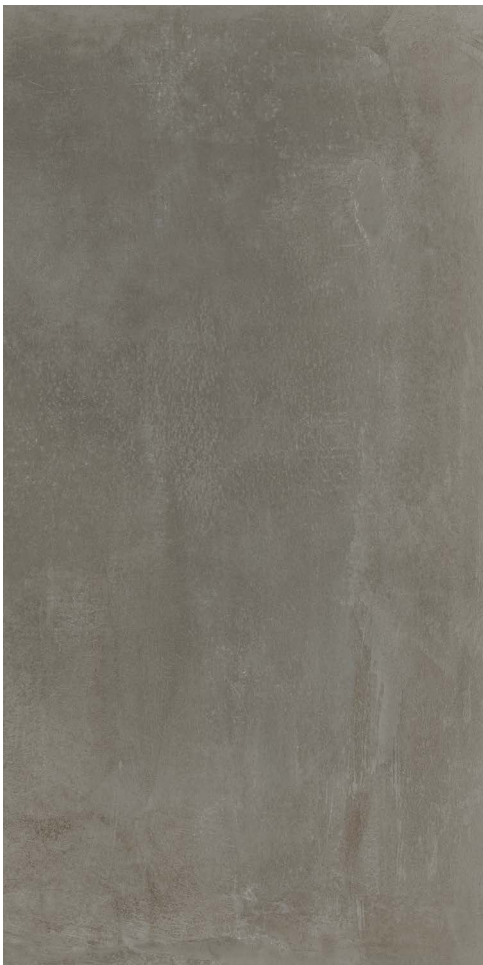
| 24x48 |