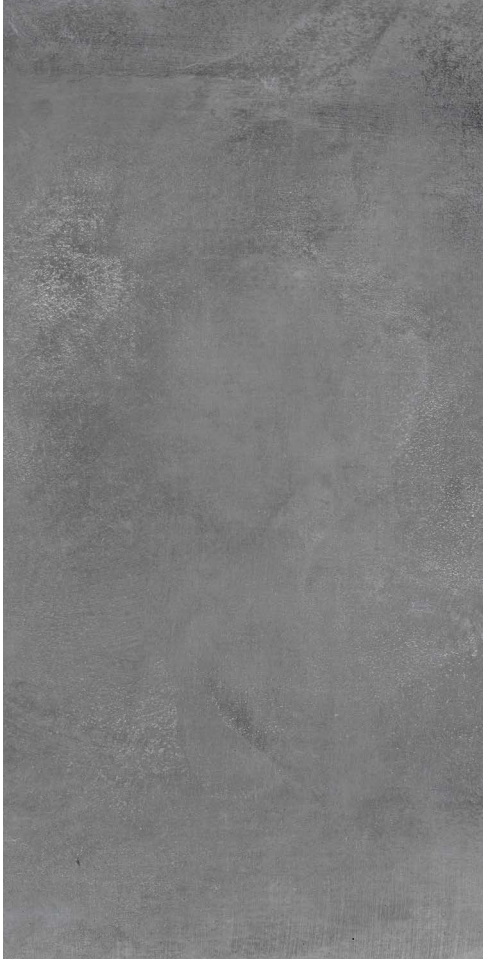
| 24x48 |