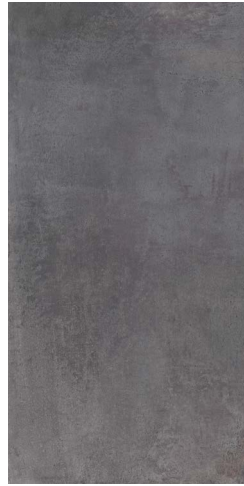
| 12x24 |