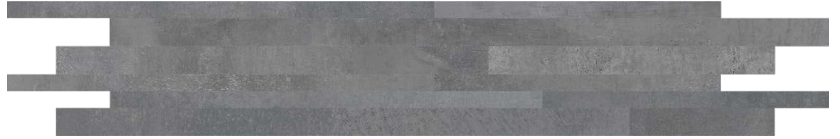
| 6.5x40 3D lineality |