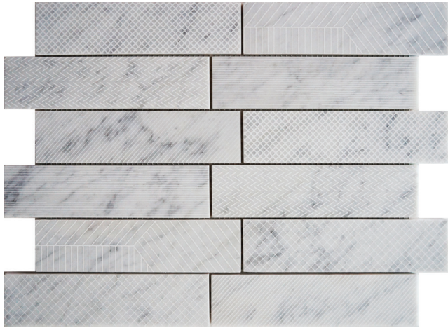
GLADMCA28 | 2x8 stack |