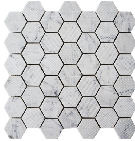
GLADMCAHEX2 | 2x2 hex |