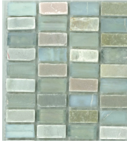
GLA HADU STACK