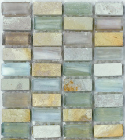
GLA HABE STACK