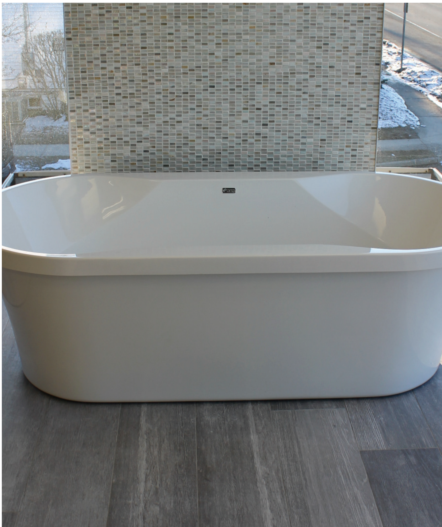
backsplash • HAMPTON DUNES | floor • ALBERO 6 SHADE