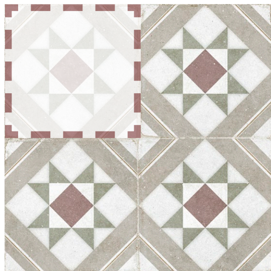
*4PCS SHOWN TO DEPICT PATTERN*